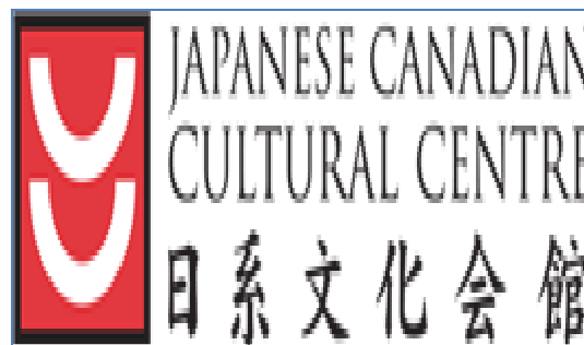
Japanese Canadian Culture Center Judokai