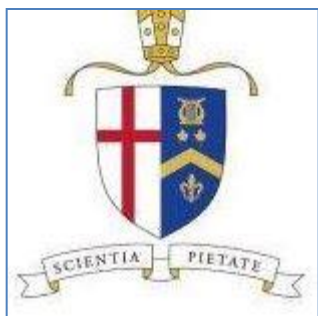
Royal St. George's College