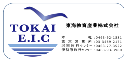
Tokai Education Instrument CO.,LTD.