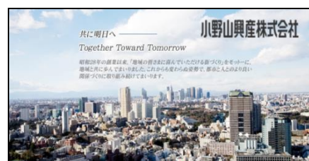
ONOYAMAKOUSAN CO., LTD.