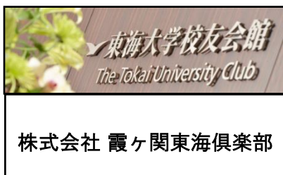
The Tokai University Club