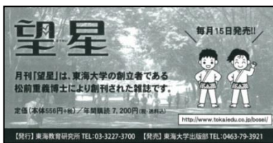
Tokai Education Laboratory CO.,LTD.