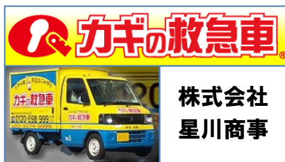
HOSHIKAWA SYOUJI Co., LTD.