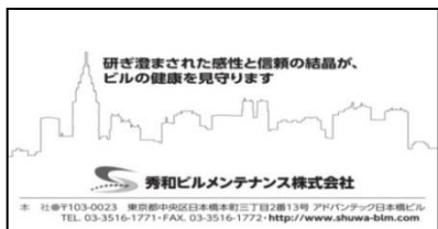
Shuwa building maintenance CO.,LTD.