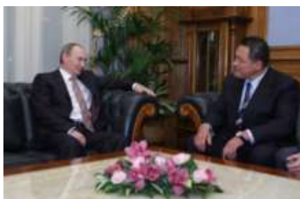
This photo shows me extending my greetings to Mr. Putin